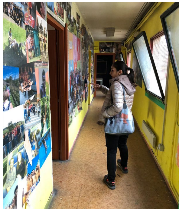
Site visit, Falklab pact, 26 October 2018.

The space inside the school will be turned into a space in which to construe the identity of the neighborhood and encourage dialogue between different generations. In the Falklab pact, the role of the State is crucial to ensure the success of the initiative, Social and Economic Pooling is still moderate because volunteering was the initial boost for the group of NGOs involved and the transition to a sustainable and productive mechanism must happen without denaturalize the process.