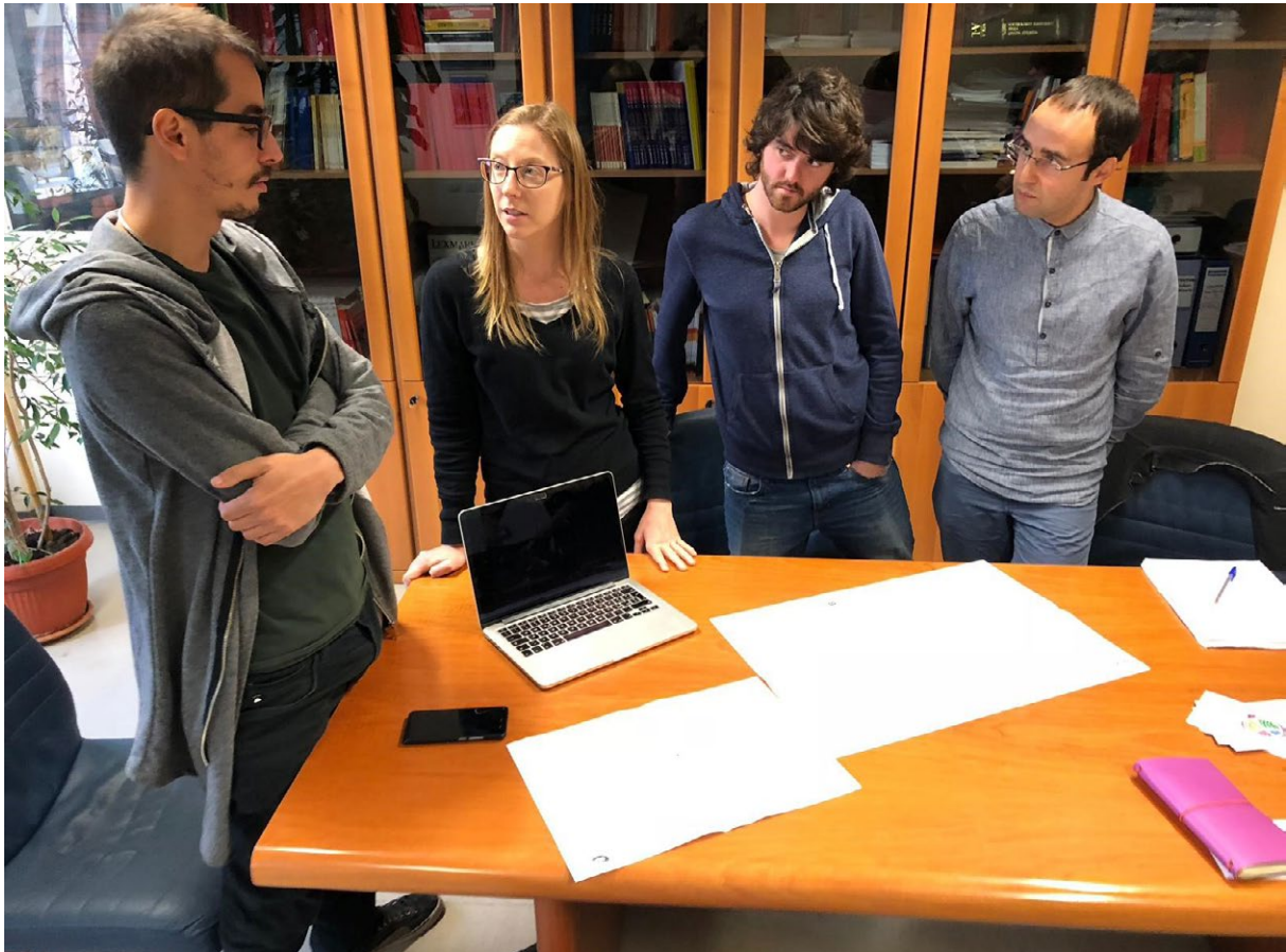
Site Visit Intercultural Center, 26 October 2018.

The Falklab pact, whose main aim is to make the physical space located in the school buildings area a point for social aggregation of teenagers and their families, through art / reading and after-school workshops.