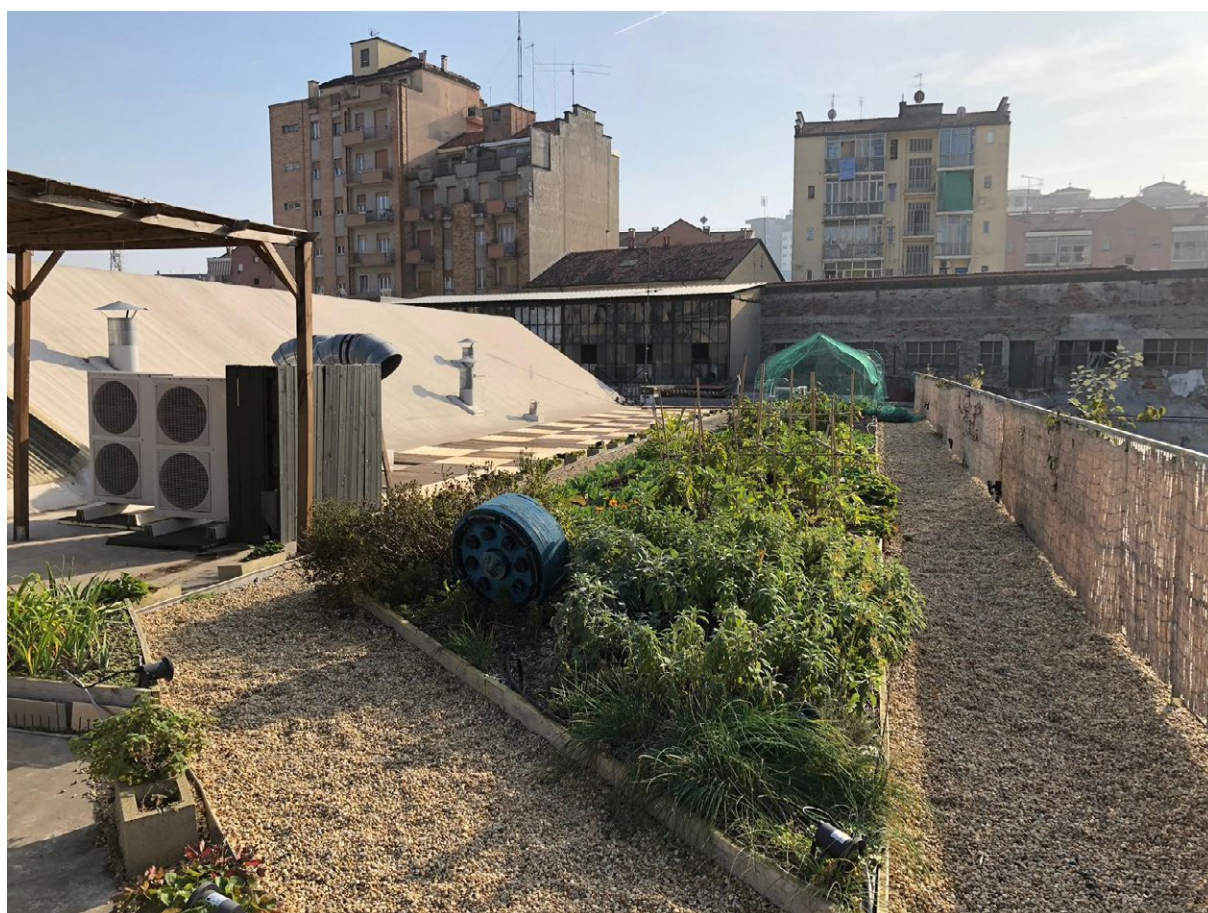
Site visit Casa Ozanam pact, 25 October 2018

The Casa Ozanam Community Hub, which aims at turning into a Neighborhood House, that is still lacking in the fifth district of the City.