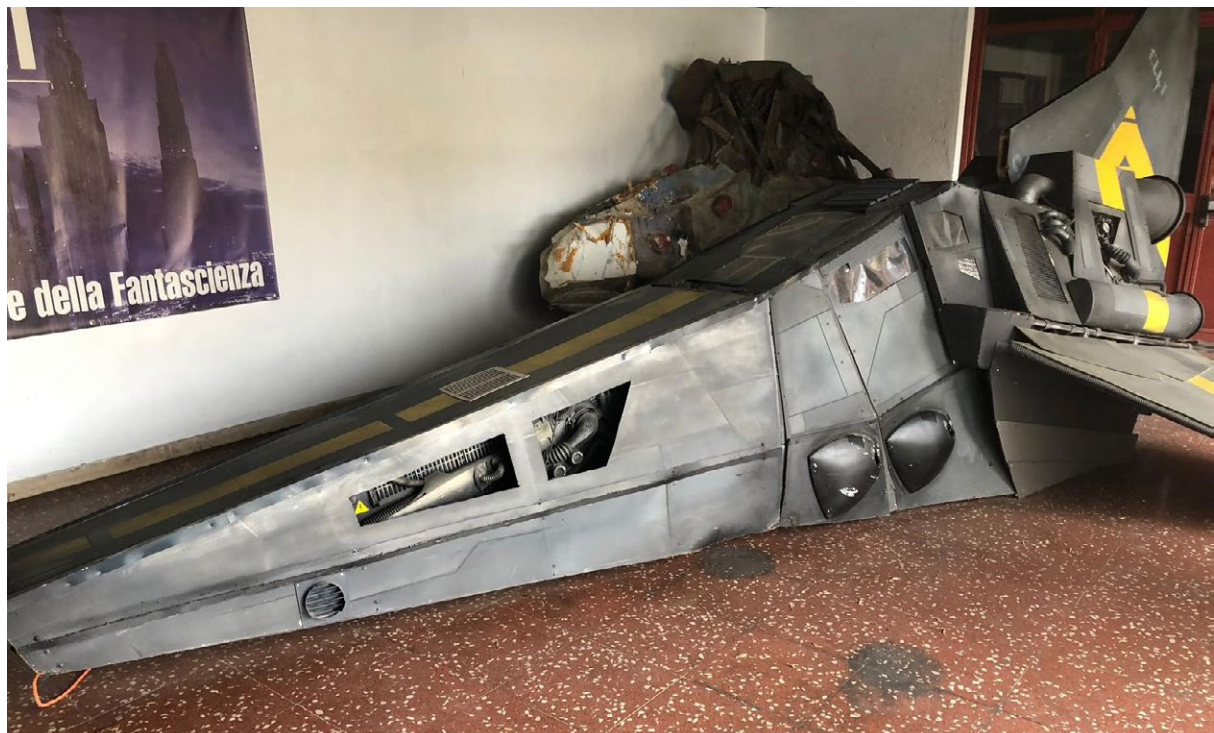
Site visit MUFANT pact, October 25, 2018.

The greatest challenge that the pacts’ signatories want to face is to attract to the museum visitors among the residents of the neighborhoods, that are not usual visitors for the Museum that instead attract people from all over the City 13 . The pacts’ project is thus installed within an ecosystem that is able to produce relevant output in terms of urban regeneration and the connection with the Museum is strong. The outdoor activities of the pact would be functional to the Museum and they would be able to reinforce the Museum’s offer and attract a bigger and more differentiated basket of visitors. The MUFANT pact presents a high degree of civic entrepreneurial capacity, since the pact proposals are willing to acquire a space to potentially enlarge the pacts’ activities.