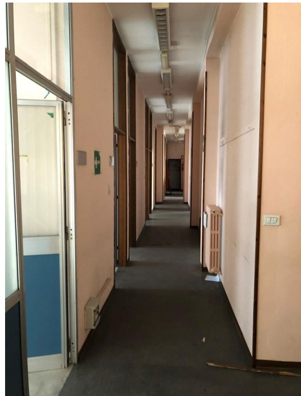
Site visit, Habitat pact, 26 October 2018.

This pact proposal seems so far to be one the most advanced ones, since three design principles are assessed as strong except for the Enabling State which is moderate mainly due to the lack of public funding however compensated by the