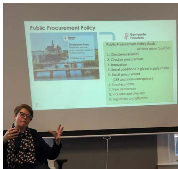
8 th Urban Partnership meeting on January 21-22 nd 2019..