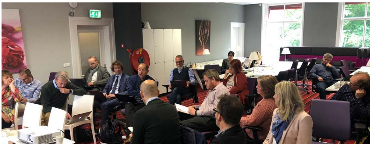
9 th Urban Partnership meeting on May 19-21 st 2019.