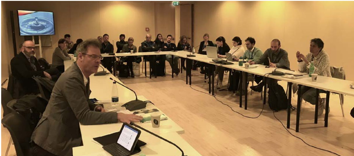
Meeting of the ANCI Working table on the commons, Forum PA, May 2019

urban partnerships, particularly in the field of public procurement.