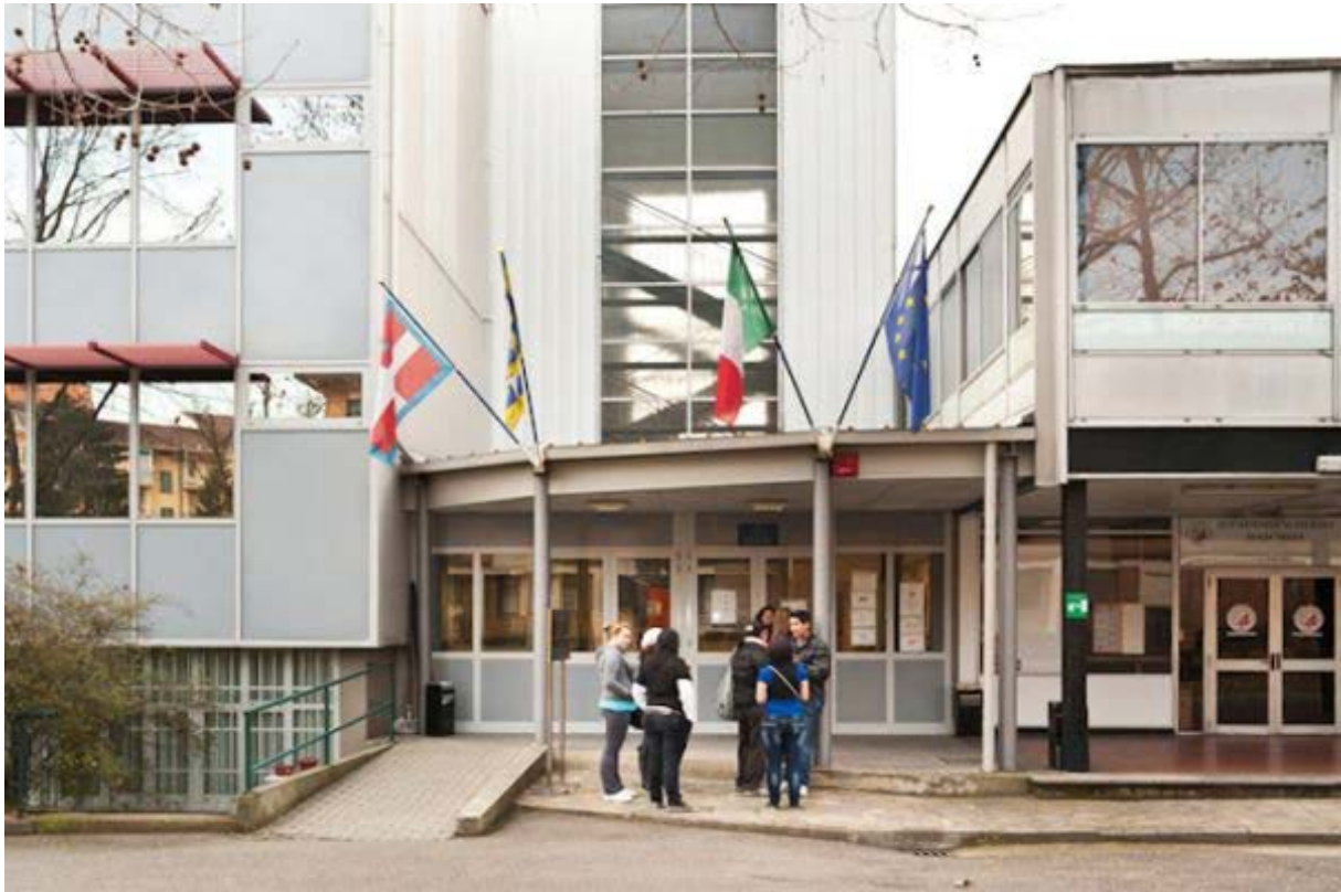
Intercultural center

formerly used as school canteen, located in the heart of Falchera, just a few kilometers away from the Intercultural Centre. Falklab aims at activating artistic workshops for teenagers in an underused building inside a school complex in order to make the physical space located in the school buildings area a point for social aggregation of teenagers and their families. The renovation works required to enable the structure to host the workshops are mainly related to securing its energy efficiency.