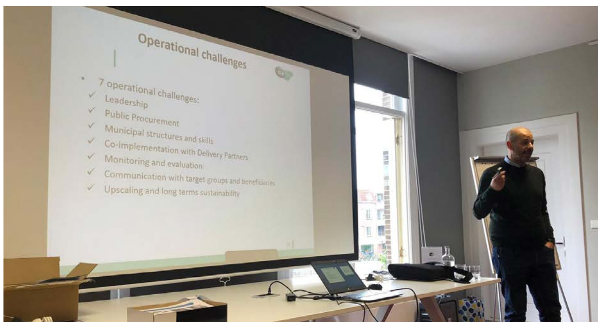
9th Urban Partnership meeting on May 19-21 st 2019.

The scoping paper “Urban Innovation Partnerships. Unleashing the Potential of Public – Community and Public – Private - Community Cooperation” available in the Co-City Turin project library (see https://www.uia-initiative.eu/en/uia-cities/turin ) has kicked off an UIA capitalization effort on Public Procurement. To deliver this pilot action the main steps and deliverables of the process will be: