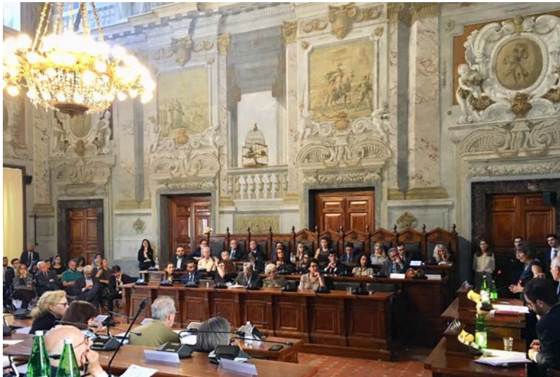
Presentation of "La Co-Città" book, Council of State, Rome, June 2019