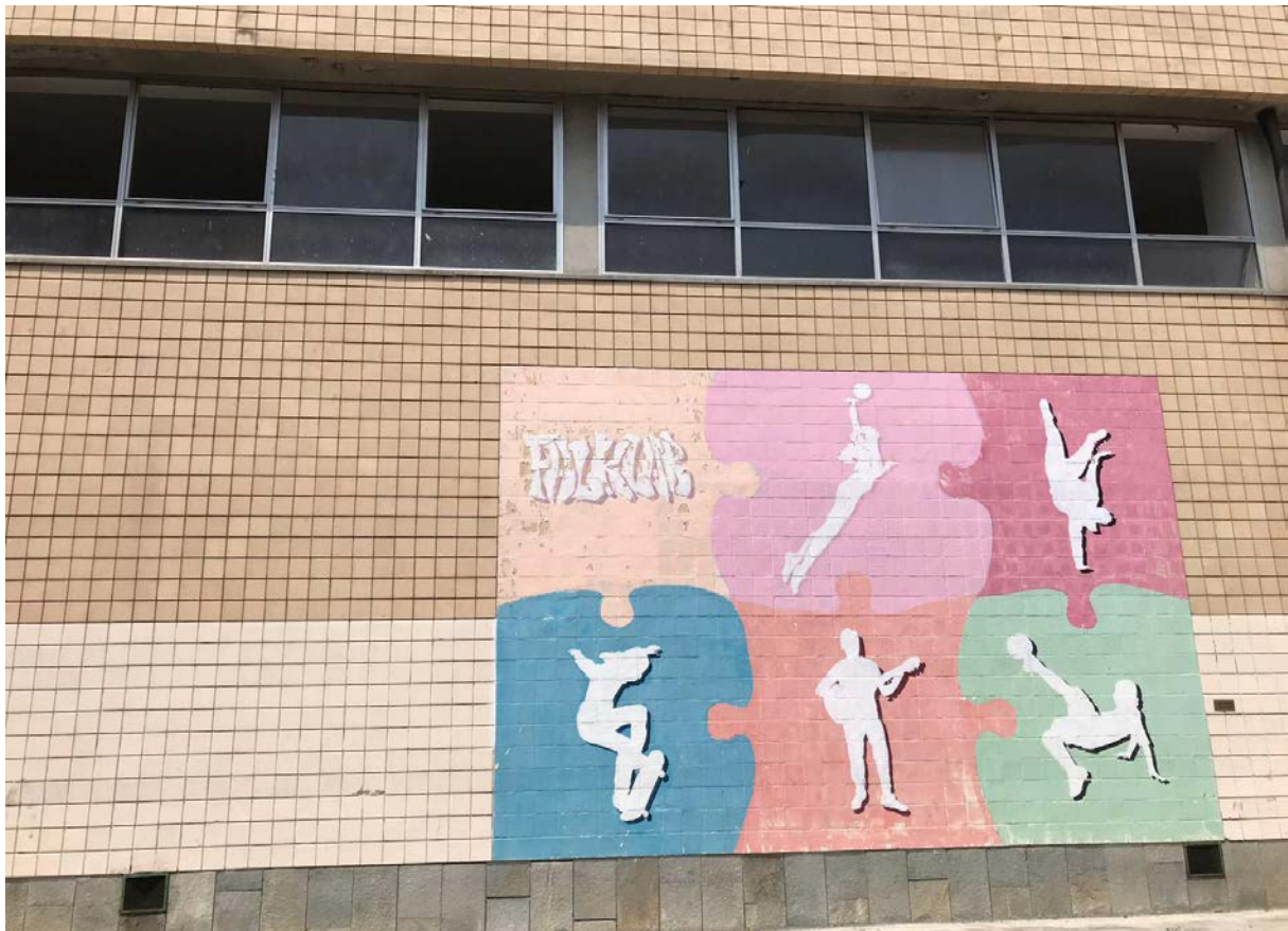
Falklab structure.