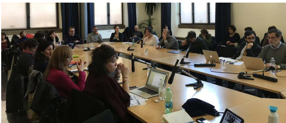
UrbInclusion Workshop_presentation of the policy paper on Innovative Public Procurement based on the Co-City Turin experience, March 7, 2019.

pilot are to raise awareness on this specific model, valorize the experience and main outcomes of the Co-city project while mapping other relevant experiences and promote the drafting of guidelines for city officials. The initialization of the joint pilot action relies upon a scoping paper that was prepared, presented and discussed in three meetings: the UrbInclusion Local Support Group (March 7, 2019); the Economic Development Forum organized by the EUROCITIES network in Florence (March 27-28 th 2019); the 9th Urban Partnership meeting on May 19-21 st 2019.